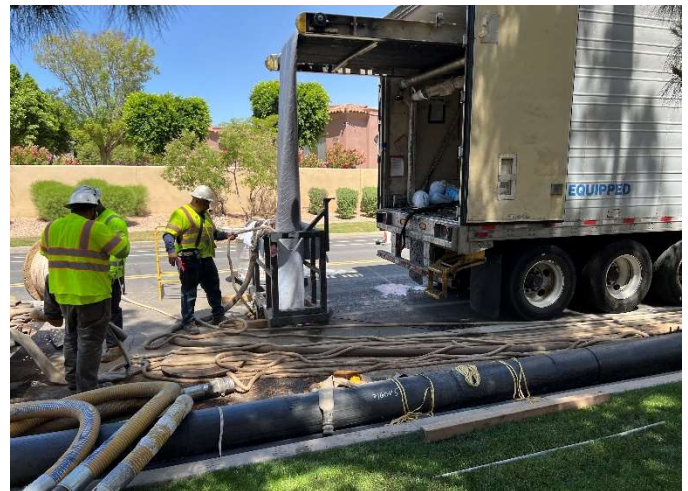
Installation of the CIPP liner

Due to the significant length of the shots, the team decided to use hot water rather than the conventional steam method to cure the liner. The hot water method required approximately 35 hours to cure, rather than the typical 5 hours necessary for steam cure. The manholes along the road were used to access the sewer line. A 4-inch hose was hooked up to a boiler to provide constant hot water circulating through the CIPP liner during the curing process. After curing, the liner was cooled down very slowly to minimize shrinkage.