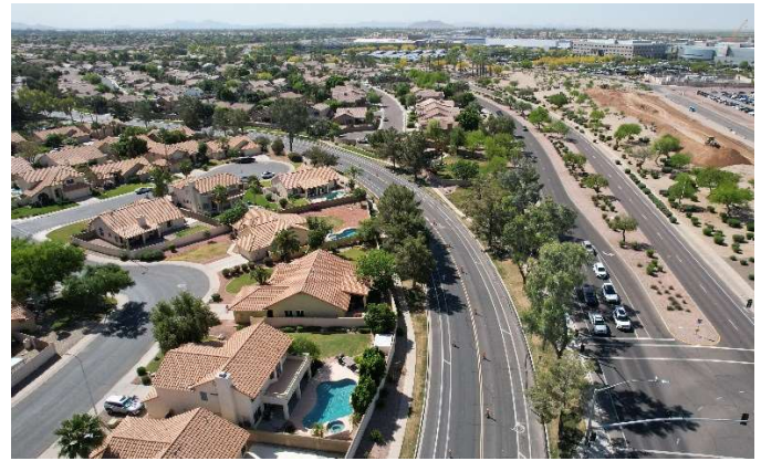
Jacaranda Parkway is a radius (curved) street

Because Jacaranda Parkway is a radius street (i.e., it follows a curve), the existing RCP follows the curvature of the road. The Jacaranda Parkway segment is approximately 3,000 feet with 13 manholes. To accelerate the construction schedule and reduce the disturbance time to the surrounding neighborhood, the CIPP installation “shots” (the distance from manhole to manhole) were extended significantly longer than average. In some cases, the shots measured up to 1,100–1,200 feet rather than the typical 400–500 feet from manhole to manhole.