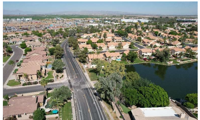
Jacaranda Parkway is located in a residential area of Chandler

At the beginning of the project, the design team captured videos of the sewer lines so areas of significant deterioration and structural degradation concern could be assessed. The existing RCP had areas where the existing PVC lining of the concrete pipe was failing. One area of concern was adjacent to a neighborhood recreational lake, which potentially could have saturated the surrounding soils. The resulting hydrostatic water pressures could have contributed to a potential catastrophic collapse of the sewer main, which would have significantly impacted surrounding businesses and residential areas.