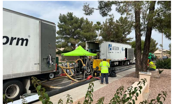
Dibble and Dibble CM provided onsite construction inspectors

Dibble also provided specialized infrastructure rehabilitation inspectors as a sub to Dibble CM for the construction management and inspection. Dibble's infrastructure rehabilitation group is a very specialized team with specific expertise in manhole and sewer rehabilitation and inspection. The specialized Dibble inspectors monitored the liner installation, while the Dibble CM inspectors inspected the restoration and bypass elements. During construction, Dibble CM and Dibble provided a team of full-time inspectors in the field.