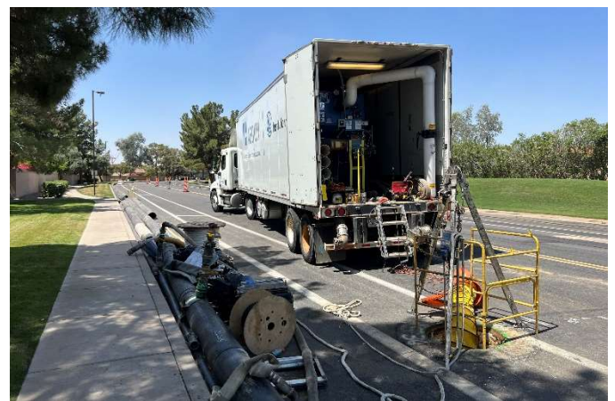
Dibble and Dibble CM partnered together on this successful project

As one of eight similar projects Dibble has designed for the City of Chandler, Jacaranda Parkway was a great continuation of Dibble's long-term relationship with the City. By providing a proactive approach to sewer maintenance, the City maintains outstanding customer services to its businesses and residents. Dibble was proud to assist the City with a cost-effective method to maintain uninterrupted sanitary sewer service to its residents for many years to come.