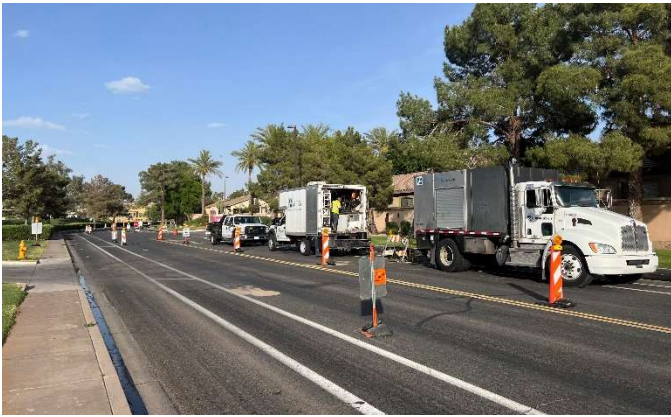
One lane of access was maintained during construction

The project required construction of an extremely long (approximately 4,000-foot) sewer bypass that operated continuously to maintain uninterrupted sewer services for about 2 months during the rehabilitation. The above-ground sewer bypass ran on the street, as well as in the landscaped areas off road in certain segments.