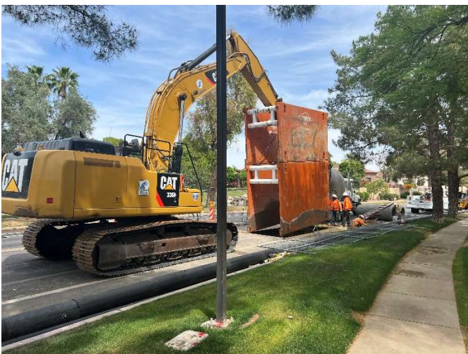
Construction along Jacaranda Parkway

The project was constructed using the Construction Manager at Risk (CMAR) project delivery method with B&F Construction as the lead contractor, Insituform as the CIPP subcontractor, and JPCI as the manhole rehabilitation subcontractor. Dibble CM led the construction management and inspection, and Dibble provided post-design engineering support services. Dibble CM managed pay request approvals and submitted requests to the City.