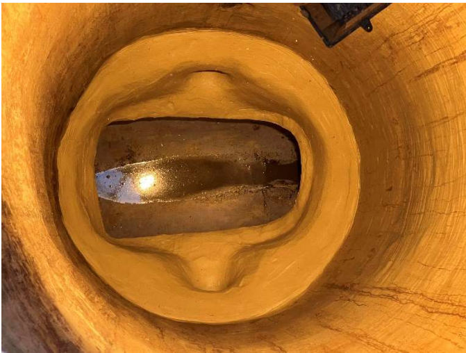
Manhole rehabilitation work was completed on 13 manholes

As the videos were taken 18 months prior to construction and design was completed 6 months prior to construction start, the construction team was initially unsure if the sewer might have experienced further damage during that time. Fortunately, the team did not encounter significant instances of additional damage during construction.